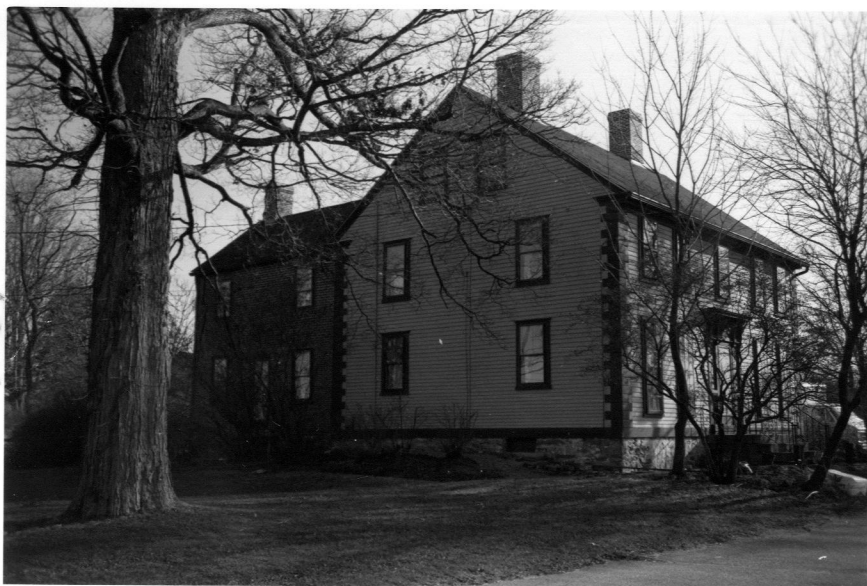
sideview of ell