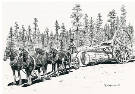
Artwork by Timothy Livingston

Once harvested, how were 150 foot white pine logs moved to the shipyards? Many were moved during the winter to take advantage of frozen ground. Their great length and ponderous weight made moving them a challenge.