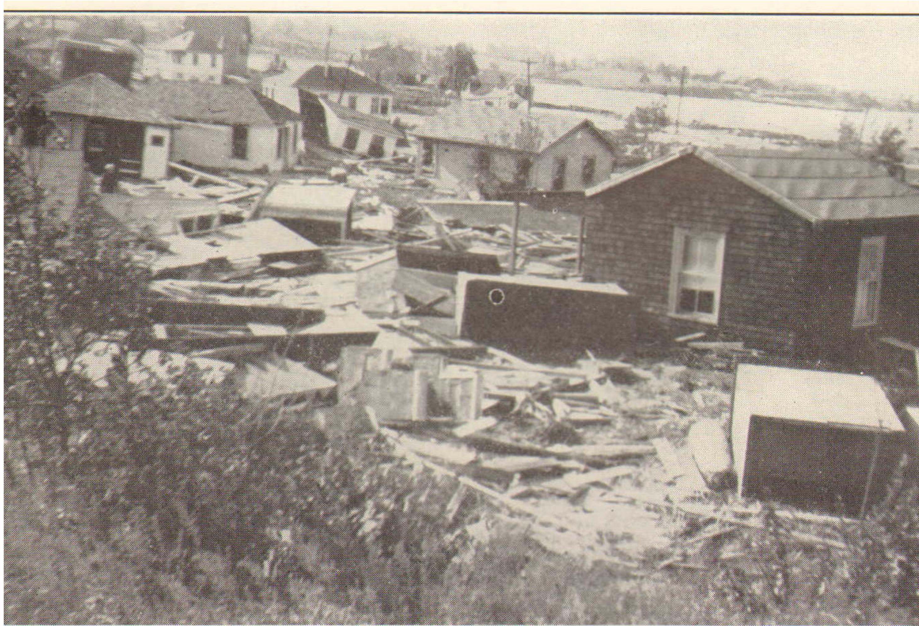
Summer homes at Ocean Grove were piled upon each other and reduced to ruins by storm.