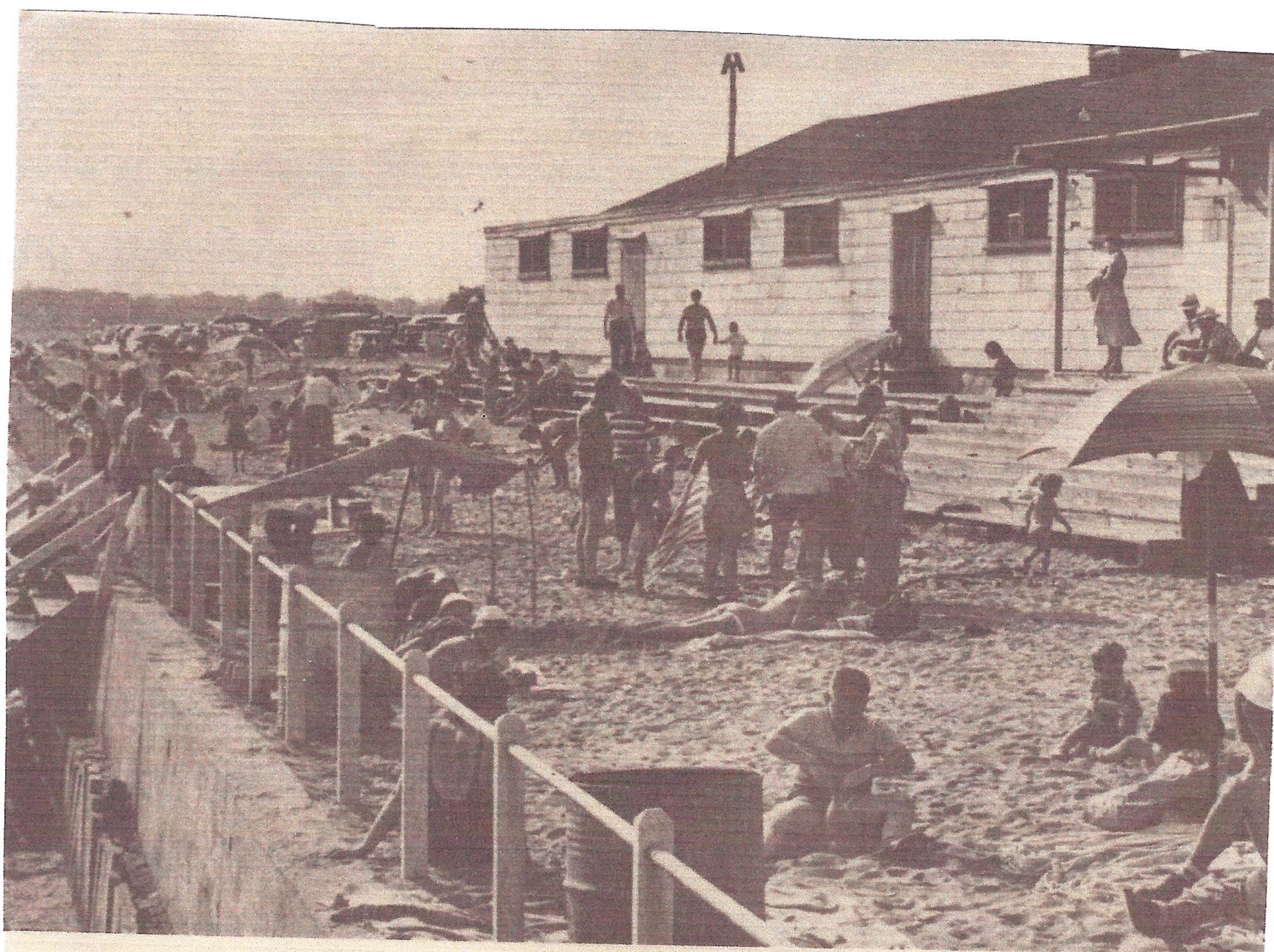
IN THE BLUFF'S HEYDAY, IT WAS DIFFICULT TO FIND A VACANT SPOT TO SPREAD A BLANKET.