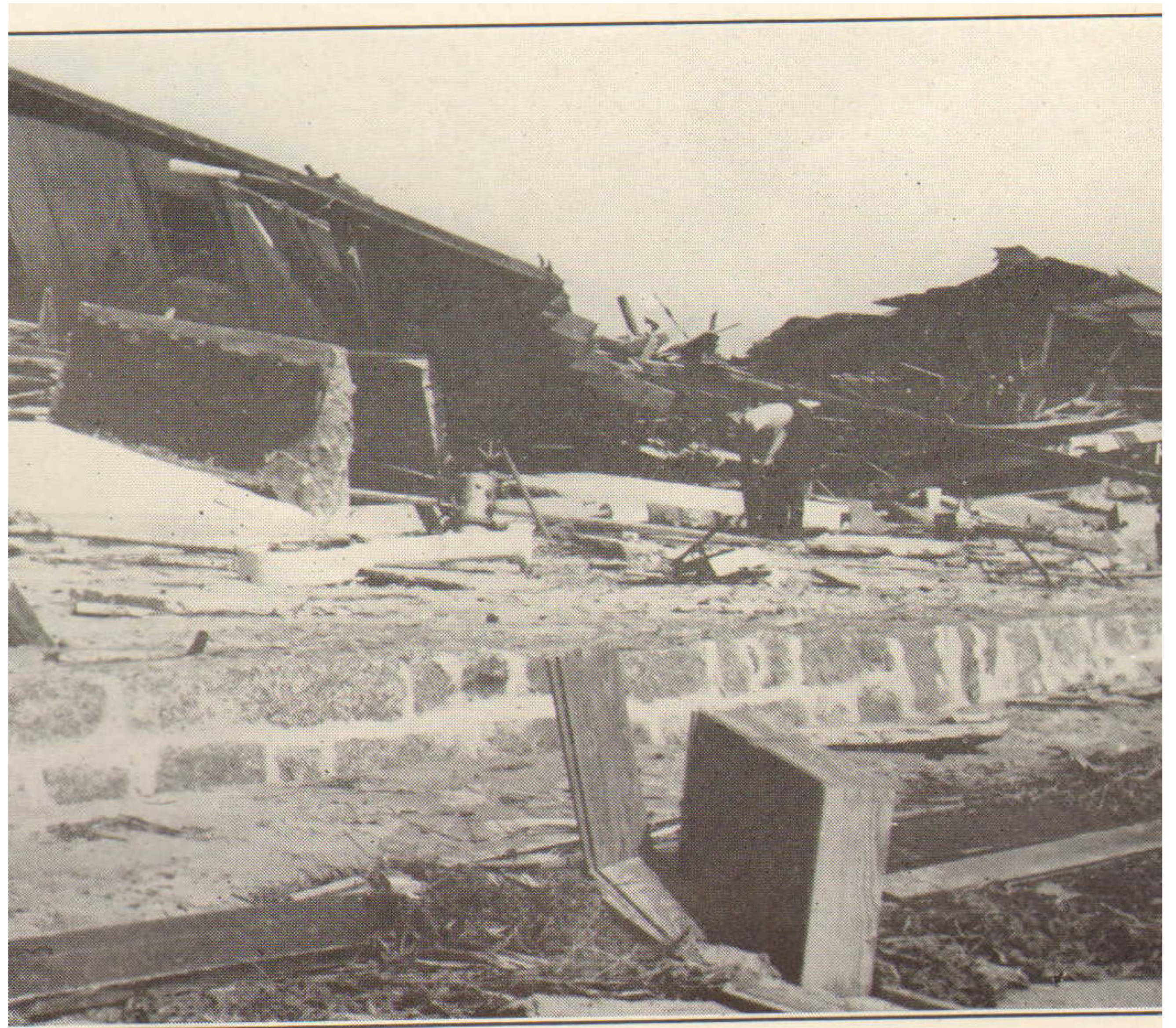
Wreckage of pavilion at Ocean Grove, pictured the morning after the st

All this and the Ocean Grove railroad station came along prior to the 1938 hurricane. This devastating event wiped out scores of cottages and businesses and took many years to rebuild. In the late 1940s, the area began to develop into year-round neighborhoods. Ocean Grove and the Bluffs remained popular through the 1960s.