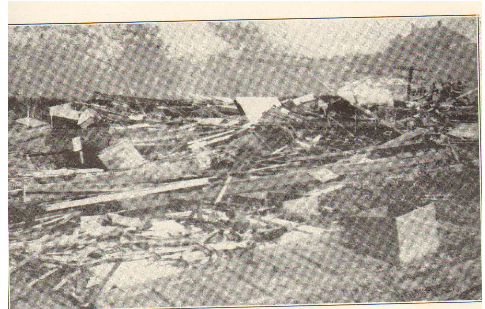
Shambles created by hurricane as it swept through Ocean Grove.