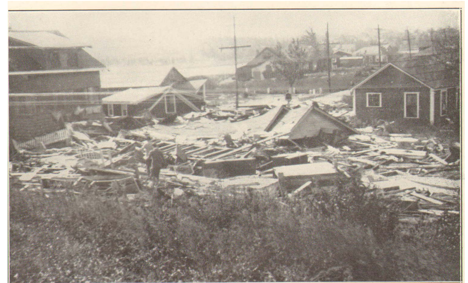
Ruins of year-round homes at Ocean Grove which were ripped from foundations by wind.