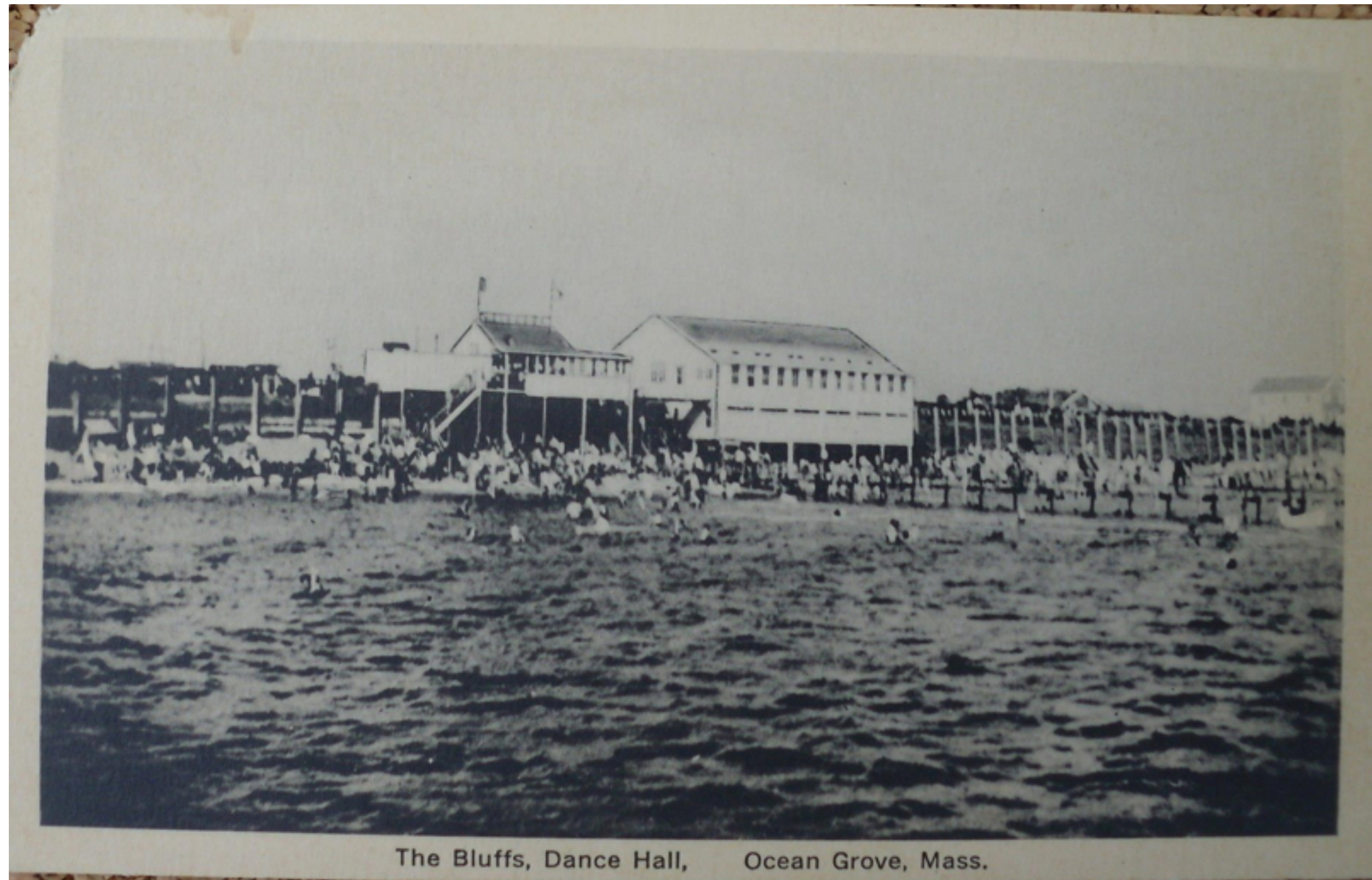
The Bluffs, Dance Hall, Ocean Grove, Mass.