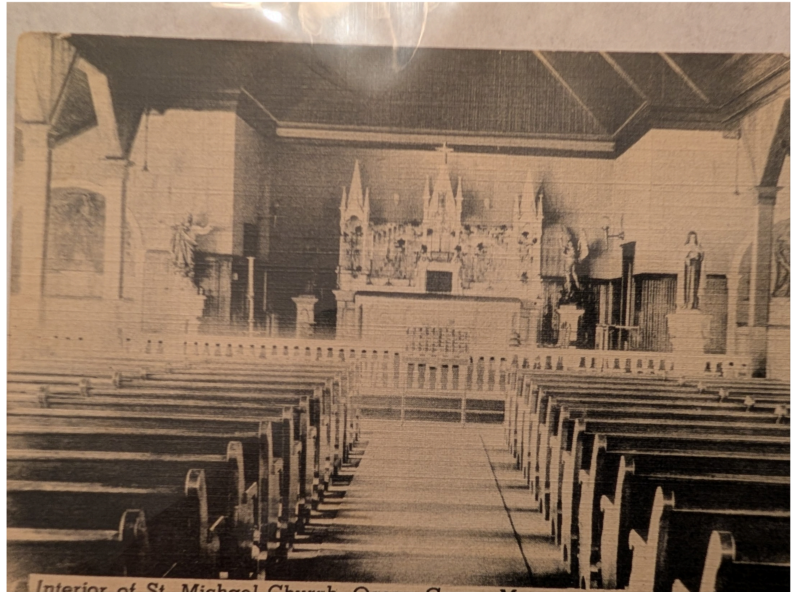
Interior of St. Michael Church