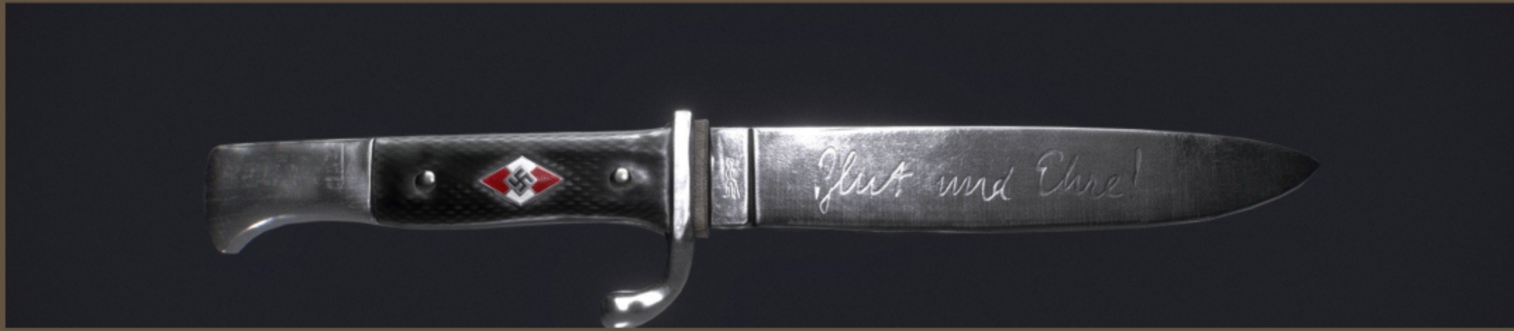
HITLER YOUTH KNIFE