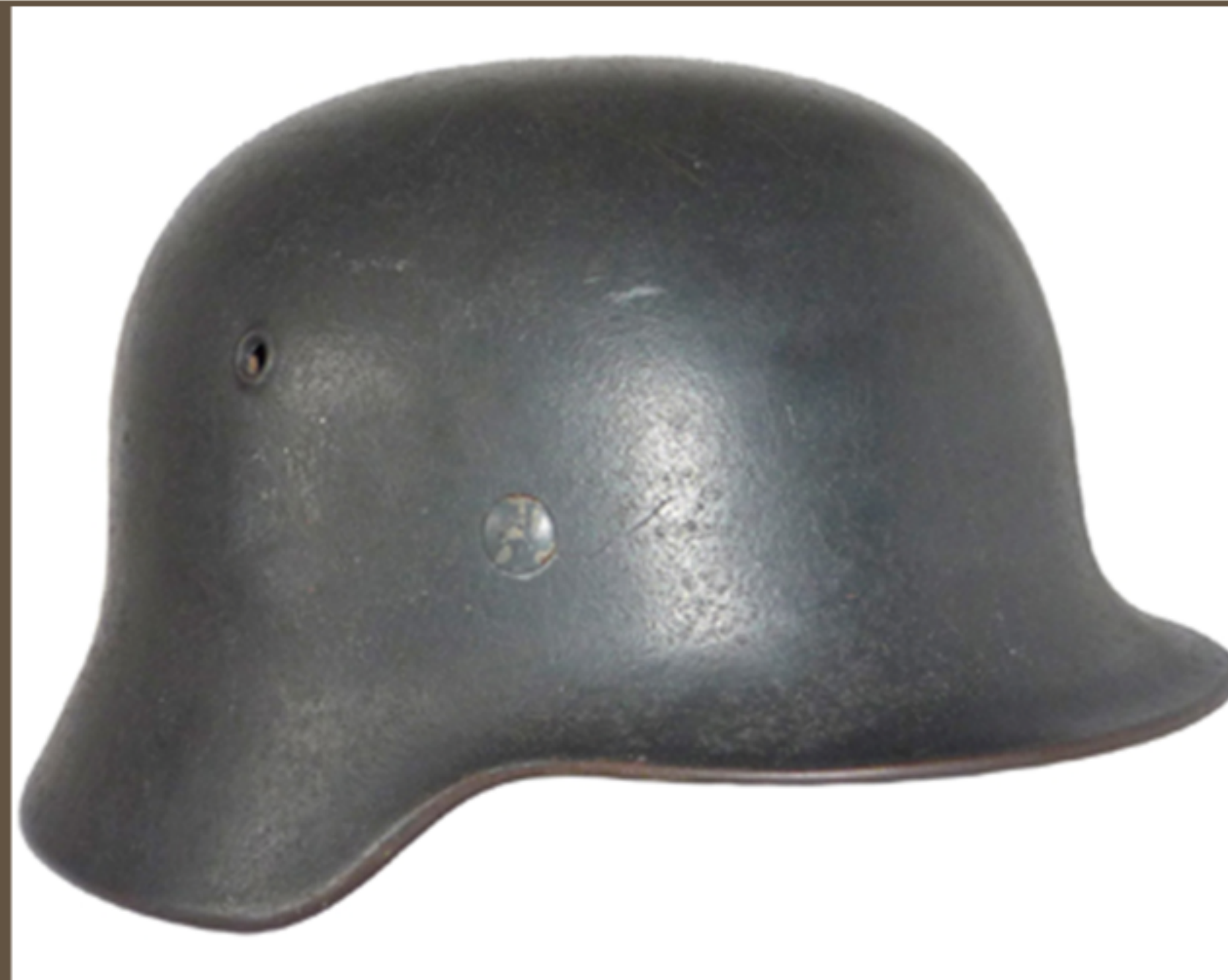
GERMAN M40 HELMET