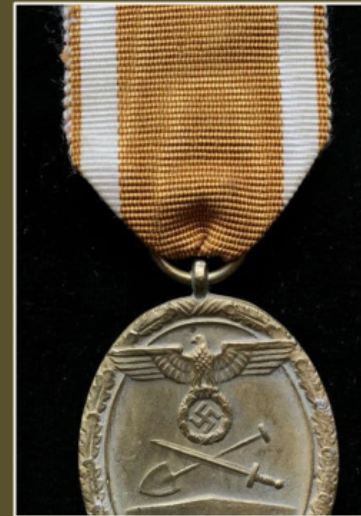
WEST WALL MEDAL